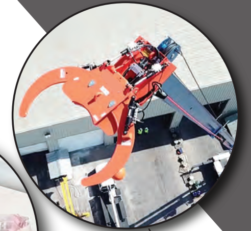
- Pole Guide System