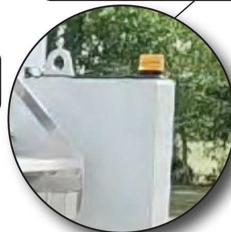
- LMI Utilization Light Tower Notifies personal of Crane Condition