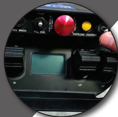
- Radio Remotes