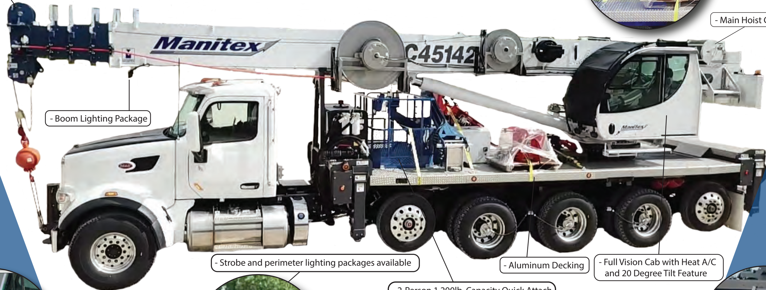
- Boom Lighting Package